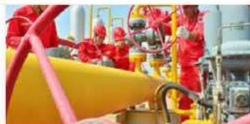
PIPETP: Pipeline Engineering programme