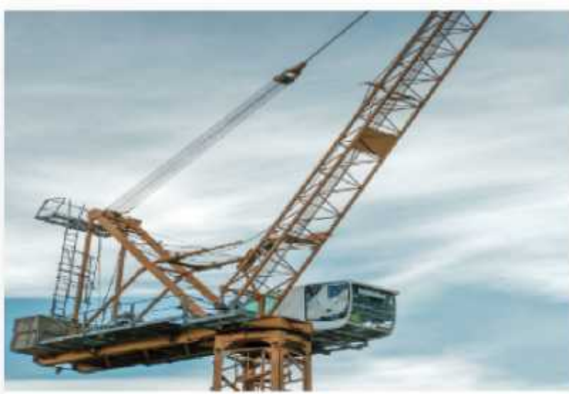
Lifting & Rigging Equipment inspection