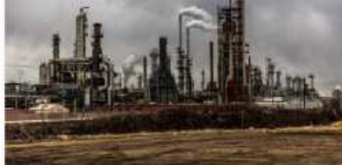
GGTP: Graduate Gas Process Programme