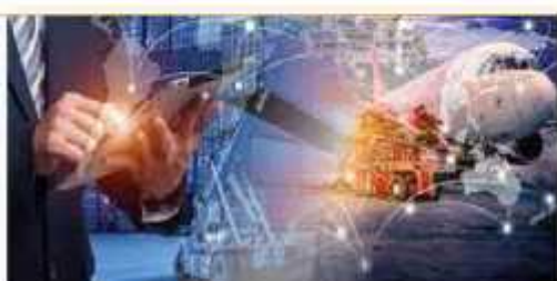
GSCLMTP: Graduate Supply Chain & Logistics Management Programme