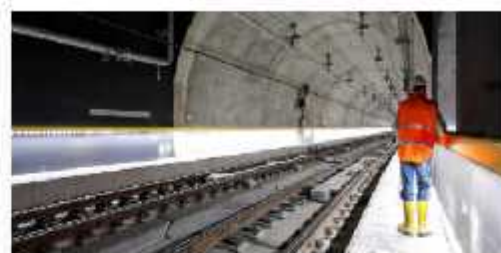
GCETP: Graduate Construction Engineering Programme