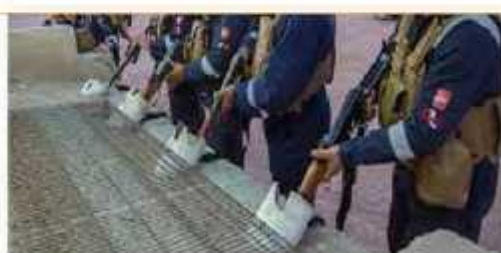
GOGSTP: Graduate Oil & Gas Security Programme