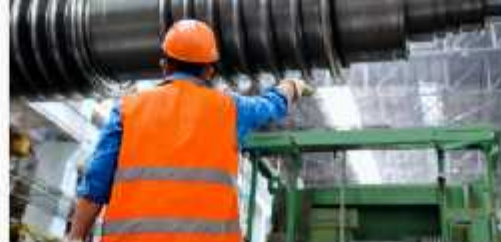
GPETP: Graduate Power Engineering programme