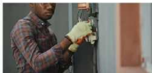
GEDTP: Graduate Electrical Design programme