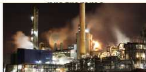
LNGTP: Liquefied Natural Gas Programme