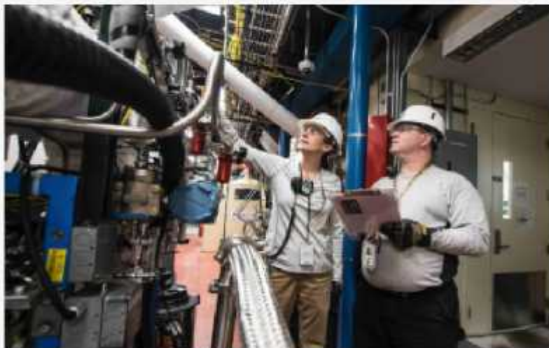
Third party Inspection