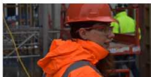
GSTP: Graduate Safety programme