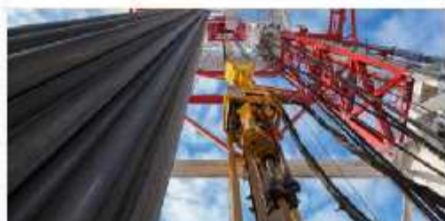
GWMT P: Graduate Oil & Gas Well Management Programme