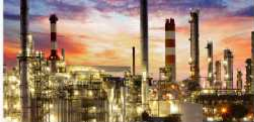
GPOTP: Graduate Production Operations programme