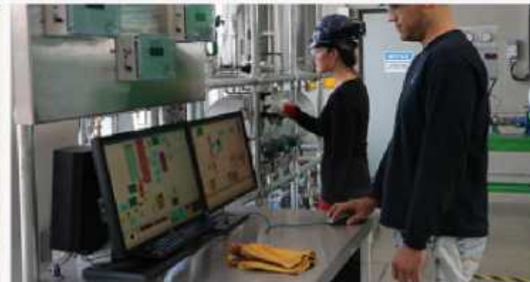
Calibration & Testing Services