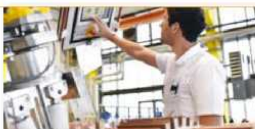
GITBATP: Graduate IT Business Analyst Programme