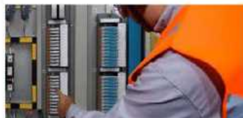
GDCSIP: Graduate Distributed Control & Safety Instrumentation