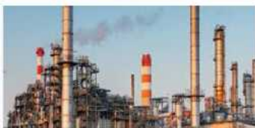
GUPITP: Graduate Upstream Petroleum Industry Programme