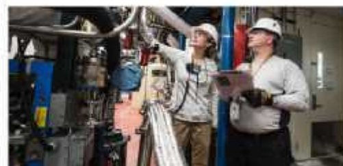
GM RTP: Graduate Maintenance and Reliability programme