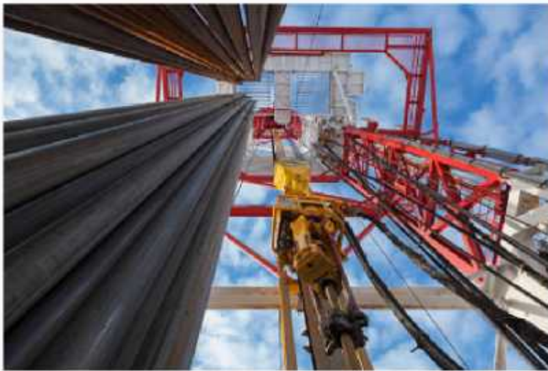
Rig Inspection & Certifications